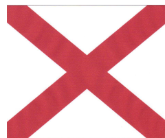
Code Flag V