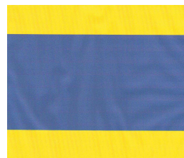
Code Flag D